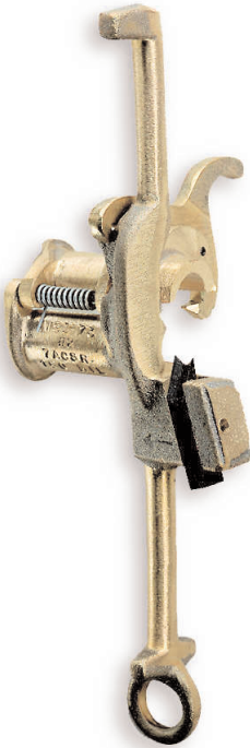
Ripley Fixed Conductor Stripping Tool WS Series* www.ripley-tools.com

Two companies offer stripping tools that facilitate the removal of the covering on Hendrix Spacer Cable and Tree Wire. They provide reliable means of completing both end and mid-span strips.