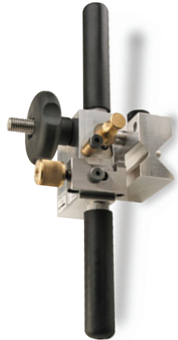
Speed Systems Adjustable Tool Model 2900 www.spdsystems.com

*When ordering a WS series tool, please provide the following information (see Hendrix catalog for cable information).