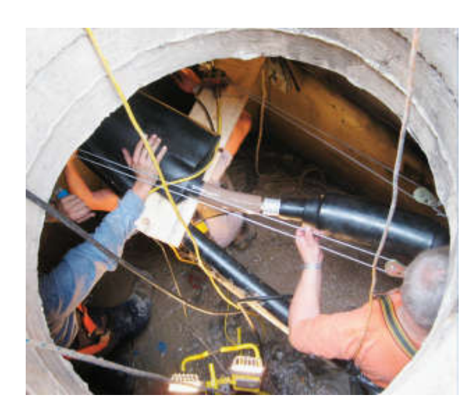
Installation of Elastimold premolded splice.