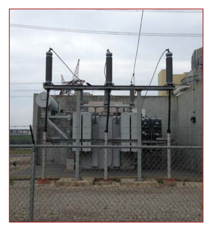
Completed G&W PAT-140 terminations.