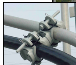
69 kV Riser