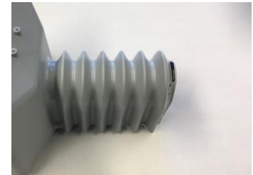
View of Cut C