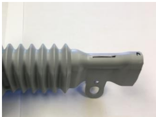
View of Cut A