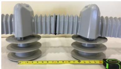
10"-15" pin-to-pin: 15" showing