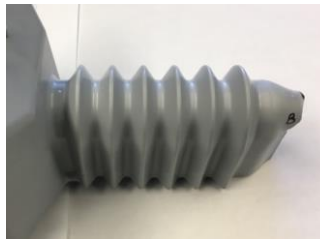
View of Cut B