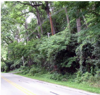
Heavily Treed & Ecologically Sensitive Areas