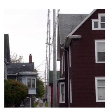
Clearance Issues & Limited Right-of-Way