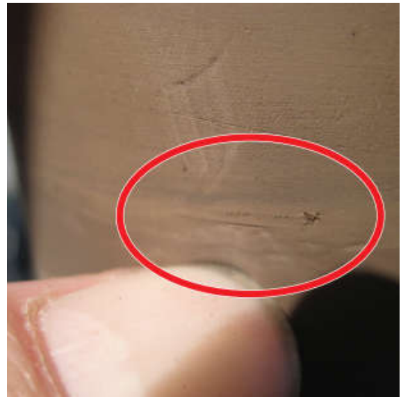
Score in insulation caused by others. Score was a potential cause of hot spots observed in the terminations. KCS technicians sanded out the score and rebuilt the terminations.