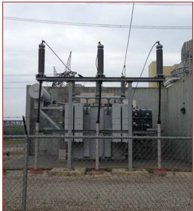
Completed G&W PAT-140 terminations.