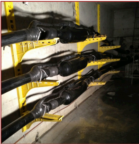
Complete G&W PMJ 140 Cold Shrink Splices