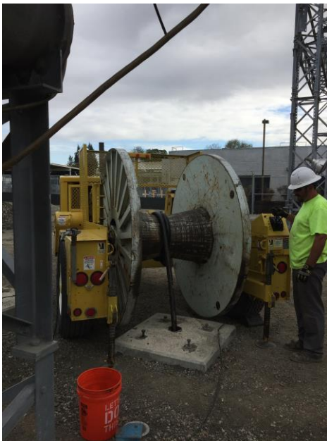
Low Pressure Oil Filled Cable Removal