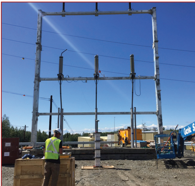
Testing cable @ 226 kV DC