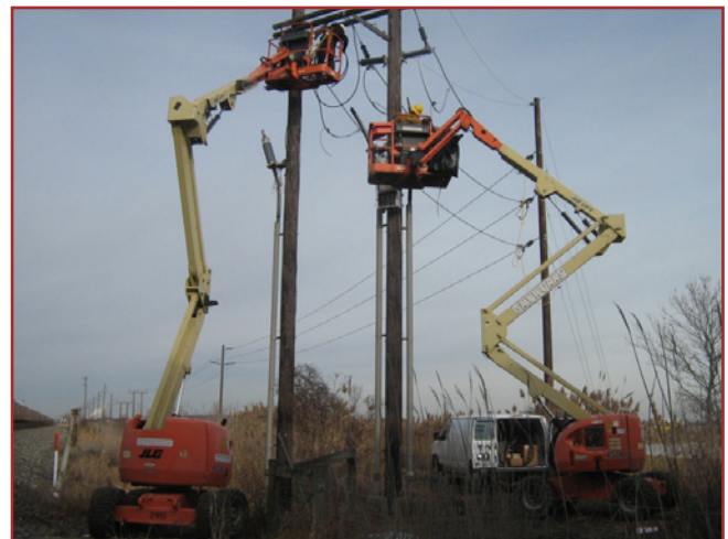
KCS along with Anderson & Wood technicians work in two separate teams to complete G&W PAT 119 terminations on riser poles.