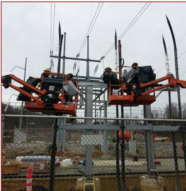
Two crews prepping cable for Tyco OHVT-145 terminations